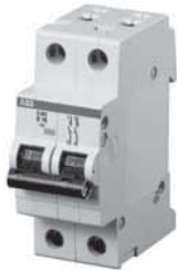
S202P-K, 2 pole